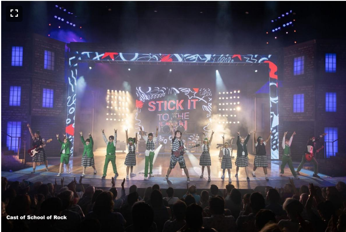
Cast of School of Rock